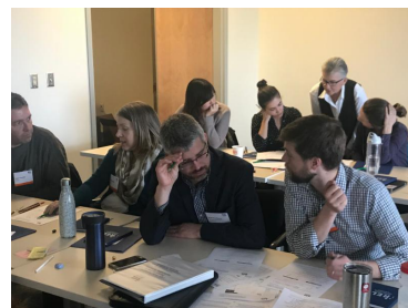
Participants worked on how to apply research-based visual representation strategies in real mathematics tasks.

What does algebra for all students look like? On January 24, the Virginia Student Success in Mathematics partnership facilitated a bridge event to help educators learn research-based strategies to support all students in achieving success in preparing for algebra. Thirty-seven mathematics educators (general and special education) of students in grades 4-6 representing the five Virginia school divisions constituting the partnership - Charlottesville, Harrisonburg, Staunton, Waynesboro, and Winchester - attended the event. REL AP staff engaged the participants in reviewing research findings on the importance of algebra in preparing students for on-time completion of high school and life after high school. Throughout the day participants completed hands-on mathematical tasks to actively apply strategies for teaching proportion and ratio skills using visual representations and strategies to support the development of mathematical vocabulary and discourse to support all students, including English learners. Access materials from the bridge event here .