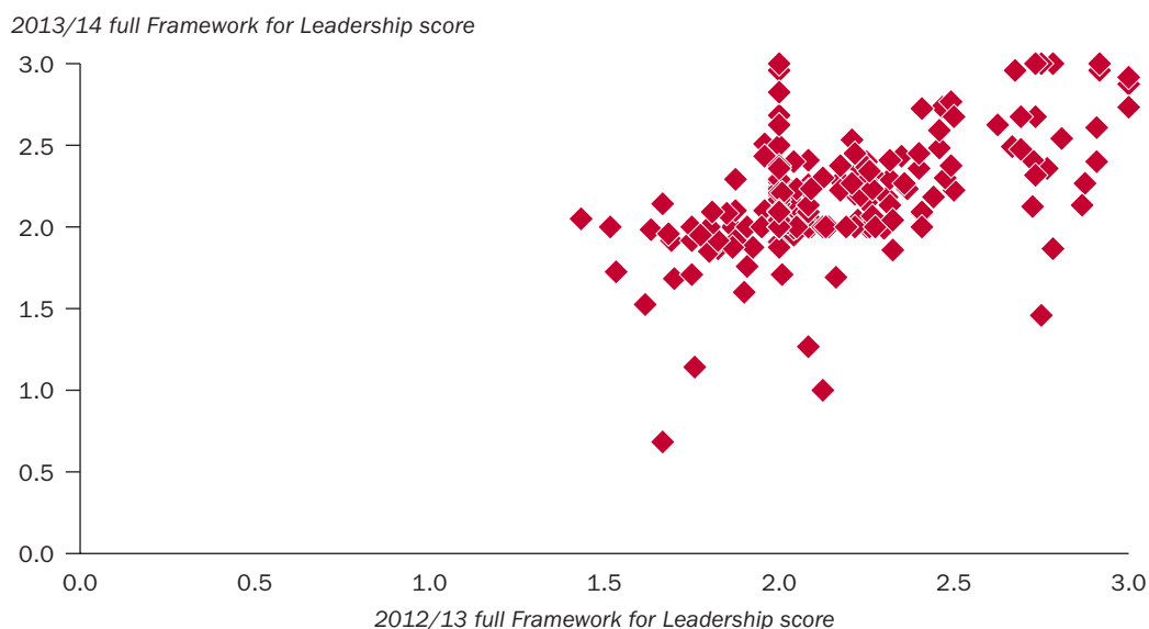
Figure 1. Full Framework for Leadership scores for principals are moderately stable across years