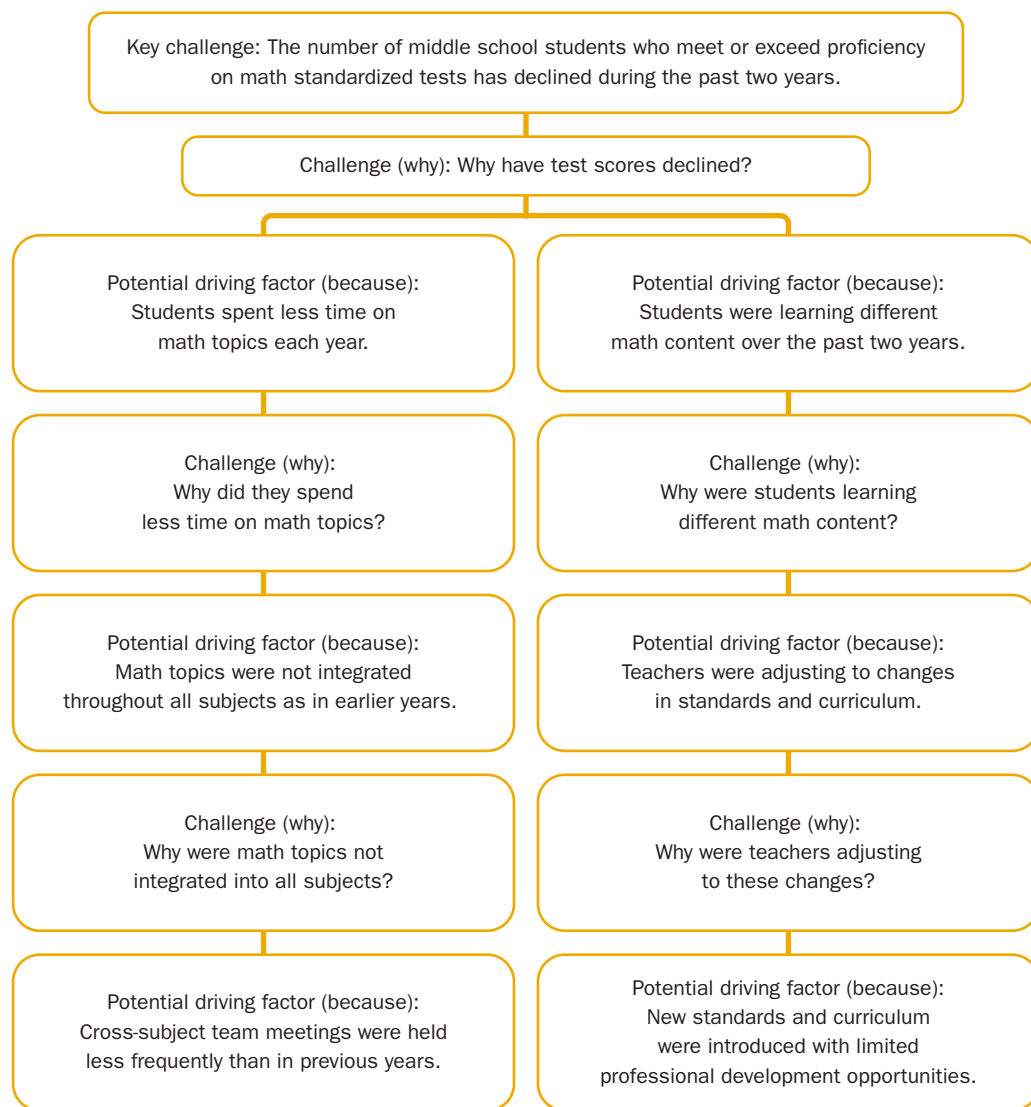
Figure 1. Identifying the driving factors

Once the potential driving factors are identified, data teams should check that the data support the ideas