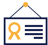
Charter School Authorizers