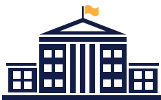
State Education Agencies