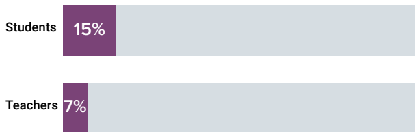
Black students and teachers as a percentage of all students and teachers.

Black students made up about 15% of public school students in the U.S., while only 7% of teachers are Black.