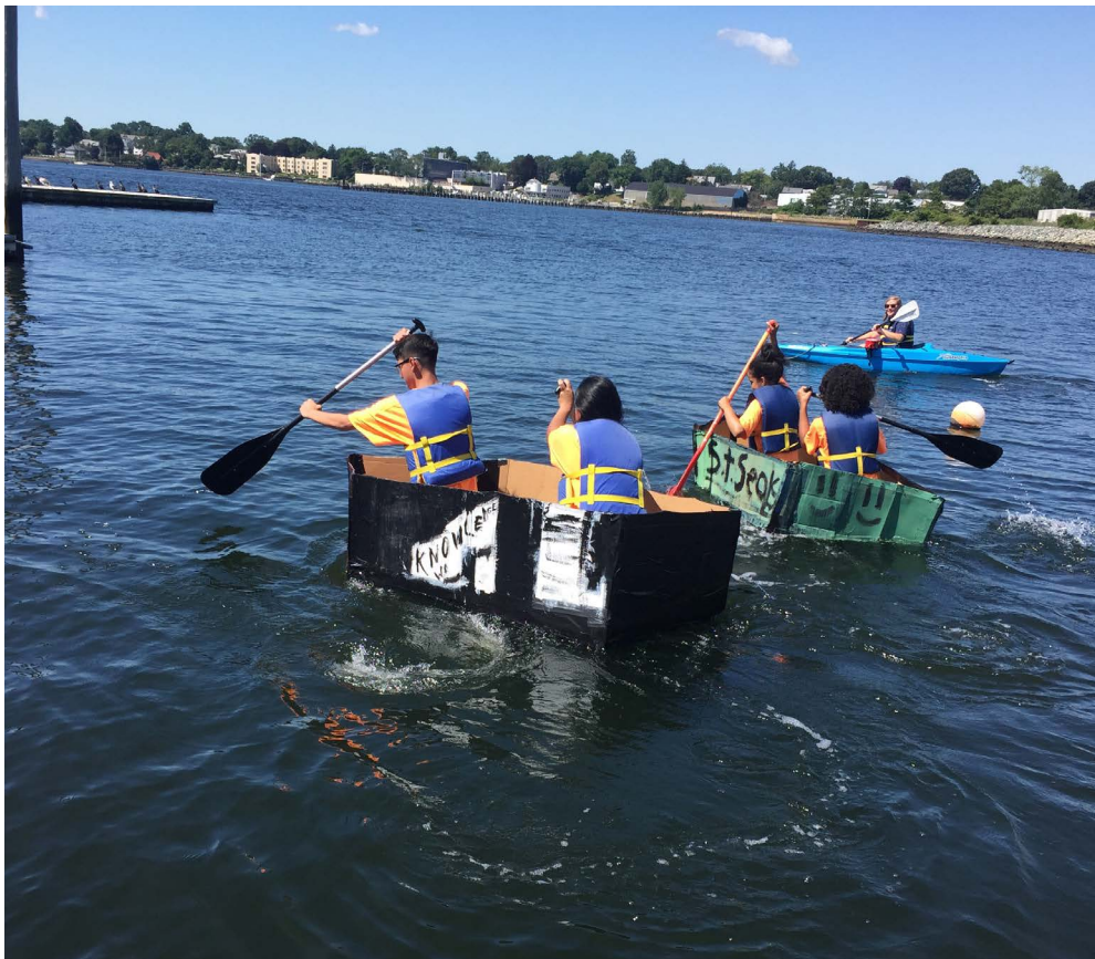
Providence After School Alliance AfterZone youth race cardboard boats they designed and built during Save the Bay's Explore the Bay program.