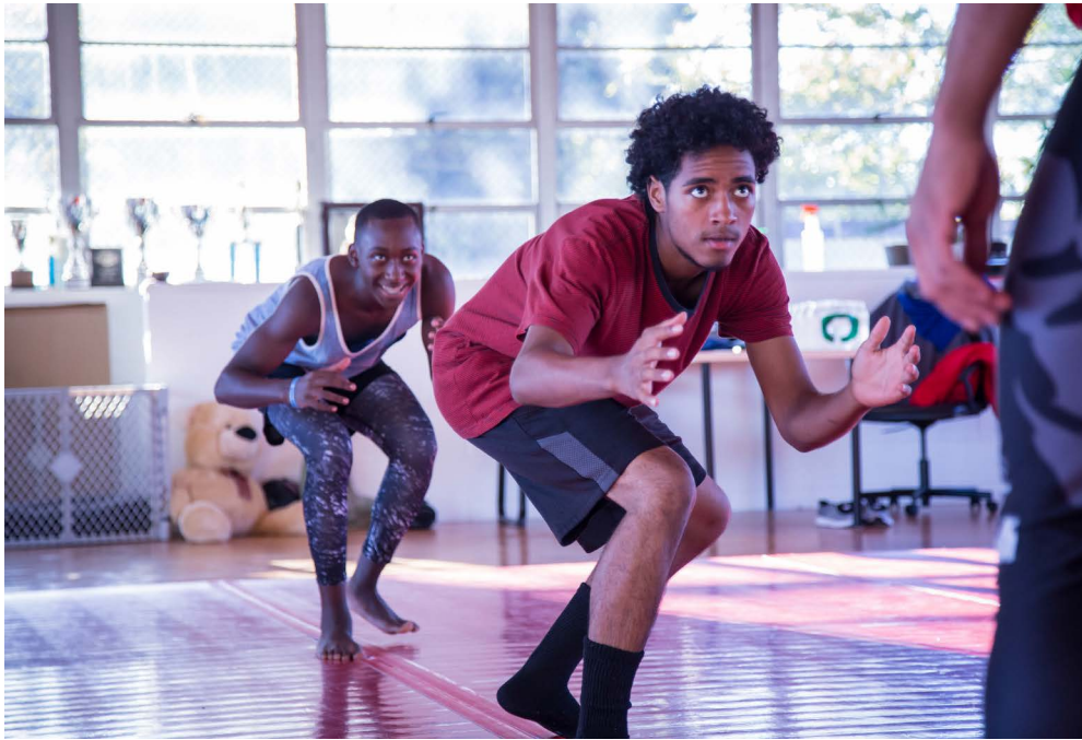
Participants of ASTRO's Take CoMMAnd program have fun warming up in the gym (Providence).