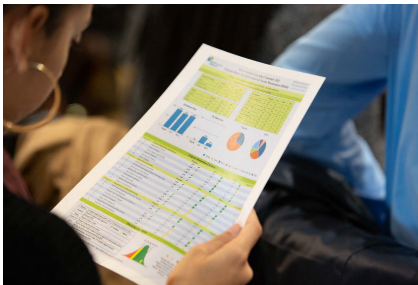
Program partners receive their Program Report for Improvement and System Measurement (PRISM) at Boston After School & Beyond's summer debrief.

some might not understand the difference between a causal and a correlational connection and therefore might be quick to jump to inappropriate conclusions. Some might need professional development, such as coaching or workshops to interpret and determine how best to use results.