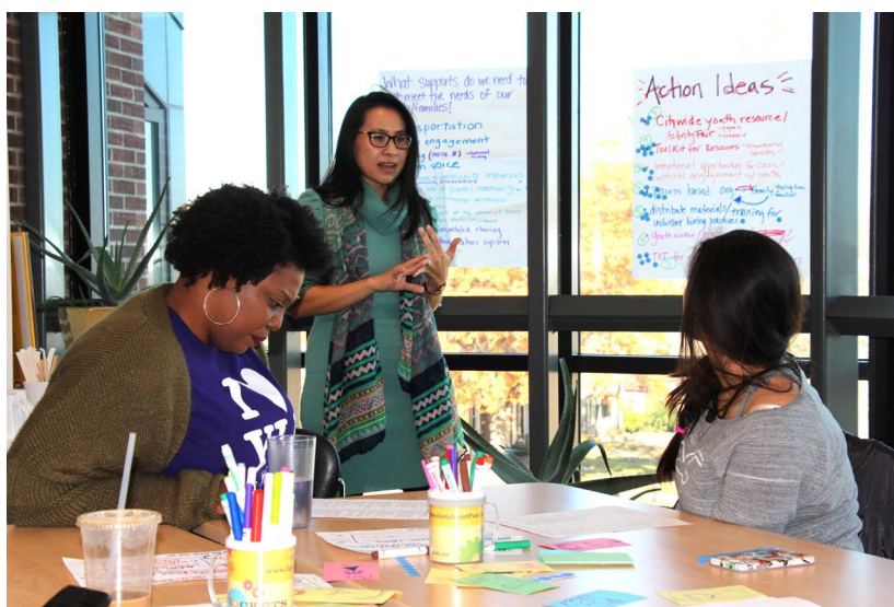
The Sprockets Community Advisory Council reviews network data to inform future engagement projects (St. Paul).

Your training plan should take account of who needs training and what they need to know to preserve the accuracy of the data they collect and to effectively interpret and apply the data they receive.