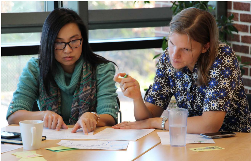
Youth workers discuss priorities based on feedback from the Sprockets network (St. Paul).

Solution: To cut costs, the intermediary decided to shift to a model whereby program staff would observe and rate their peers. The challenge now was to ensure that the observations continued to produce timely, reliable data. This meant developing a pipeline to recruit, select, train, and certify the observers and, if necessary, retrain them after the first round of observations. Training focused not only on how to properly observe and rate a fellow program but also on how to enter and process the data accurately and on time. This new approach calls for more communication and coordination than before, and as the intermediary continues to test out the approach, it will likely need to tweak its training and procedures.