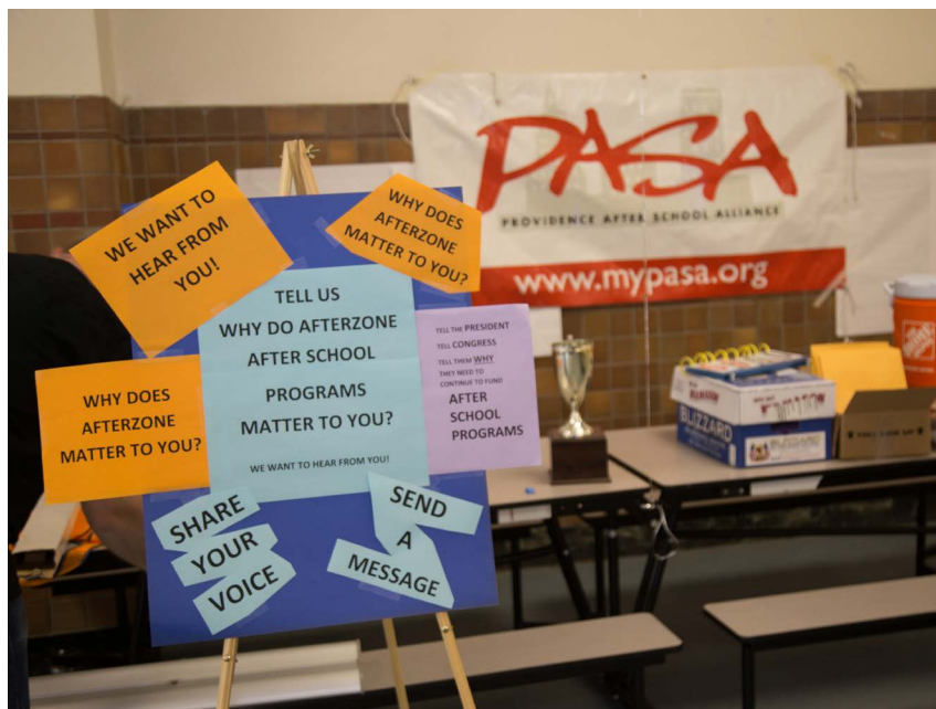
The Providence After School Alliance solicits feedback with a display board at a youth and family event.

Your data dictionary should also specify what values , or descriptive information, to assign to each piece of data you intend to collect. If, for example, you are using a survey, checklist, or other instrument, the data dictionary should include a separate entry for each question, indicating the question number, what constitutes a valid answer (e.g., a scale of 1–5), and the name of the instrument (because the same answer, whether it is a number or a word, such as “rarely” or “sometimes,” can have different meanings or values, depending on the instrument). The data dictionary should also specify variable type—whether it is “string” or text, such as “always, sometimes, or never” or numeric, such as having a value of 1–5, with the numbers clearly defined. You should also include the date the data were collected because some data points (e.g., age or grade level) change over time. See Table 2 for sample data dictionary entries.