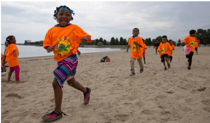
Students from Haynes Early Education Center enjoy the beach after using their scientific discovery skills with New England Aquarium staff (Boston).

The data coordinator should have some prior experience working with data, as well as ongoing professional development opportunities.