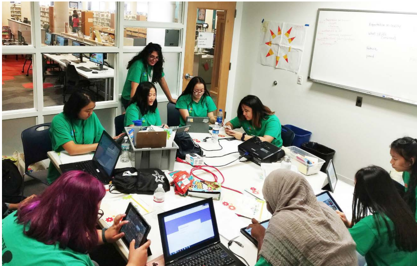
The Sprockets Community Engagement Team develops a group presentation using data from a citywide survey project on after-school access (St. Paul).

Solution: Each intermediary identified and articulated its goals for youth participation and outcomes, for program performance, and for the system as a whole. They then determined what data they would need to support those goals. All of the intermediaries emerged from this process with a renewed understanding of the purpose of their data efforts and how to communicate that purpose to stakeholders. One decided to drop certain data collection activities (e.g., reducing the number of student surveys administered), while another looked to pilot new ways of measuring youth outcomes.