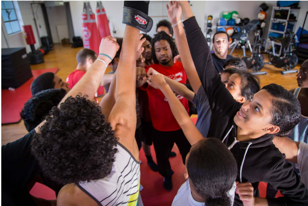
Members of ASTRO's Take CoMMAnd program gather as a team to close out their training (Providence).