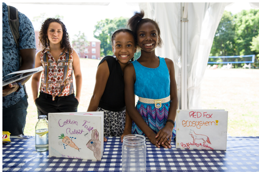
Students show off their final projects to friends and family at Thompson Island Outward Bound Education Center’s summer program (Boston).

RAND researchers reviewed the quality of the data that the intermediaries in the three cities collect; the measurement tools they use; the condition of their databases; the way they store, process, and use data; and the resources—human, material, and financial—that they bring to bear on their data-related work. The review revealed a number of organizational, technical, and political challenges. Some are specific to individual cities and intermediaries, but others are likely shared by intermediaries across the country. These include how to decide what data to collect to meet the intermediary’s goals, how to develop long-lasting policies and practices for collecting and managing data, how to use data in a timely and meaningful way, and how to examine connections among the data at system, program, and youth levels.