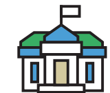
State education agencies

REL Midwest conducts its work through research partnerships with key organizations, groups, and individuals who influence education policy and practice: