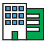
Regional education service centers